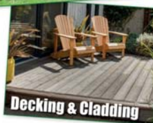
Decking & Cladding